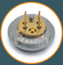
13 mm Weldable 85H

High Accuracy. Integrated and Compact Package. Digital I 2 C or Analog Output. Ready for Industrial IoT.