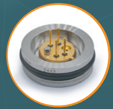
19 mm O-RING 82H