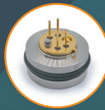
16 mm O-RING 86H