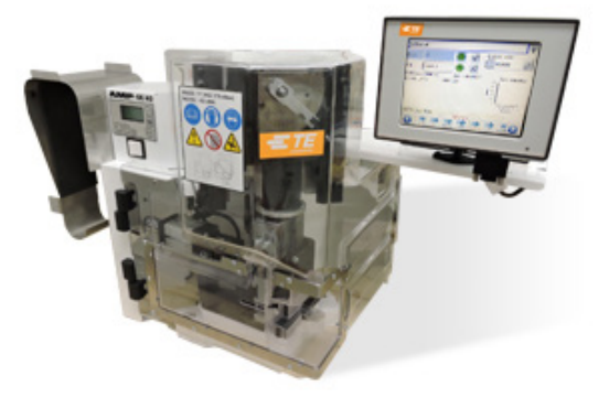
Pig-tail Splice Model

The IST machine provides better access to present wires to the crimping area. This provides more flexibility when terminating leads from completed motor assemblies. When using the pig-tail applicator, operators can cut excess wire using the integrated shear in the applicator, thereby keeping leads as small as possible (short break out). The shorter leads provide added flexibility to post process magnet wire applications. Operators can more easily tuck in or heat shrink terminated lead ends, allowing for potentially smaller motor housings.