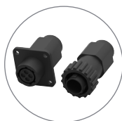
SEALED, UV-STABLE CPC CABLE-TO-PANEL