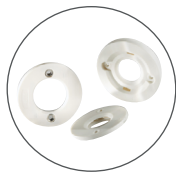
LUMAWISE LED HOLDERS