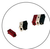
BUCHANAN WIREMATE MODULAR/RELEASABLE SMT POKE-IN CONNECTORS