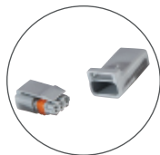
MINI SLIMSEAL WIRE-TO-BOARD