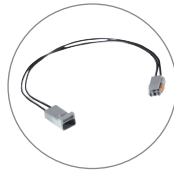
MINI SLIMSEAL WIRE-TO-WIRE