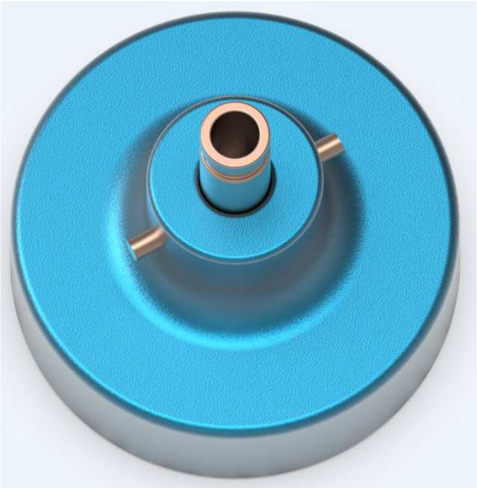
PICTORIAL VIEW OF M12 POSITIONER IMAGE CAN BE DIFFERENT TO THE ORIGINAL PRODUCT