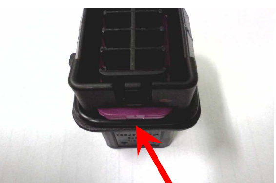
DETAIL "B" Locked position of Sec lock.

The connector can be returned to proper function by retracting the secondary Lock to position shown in Detail "A" above, using the following procedure: