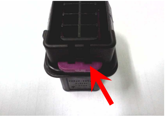
DETAIL "A" Supplied with a pre-assembled Secondary lock.

This connector is supplied to the customer with SECONDARY LOCK in pre-assembled position shown in Detail "A"..