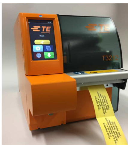
T3212 fitted with a perforator

For more details regarding printer accessories please consult TTDS-260, and for more details concerning the Universal reel holder please consult TTDS-259.