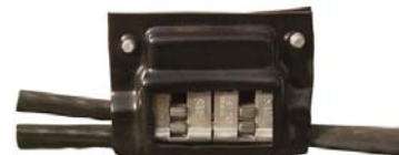
Plastic cover application