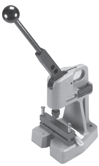
Manual Miniature Application Frame Assembly 91295-1 with Cover Closing Kit 543518-1