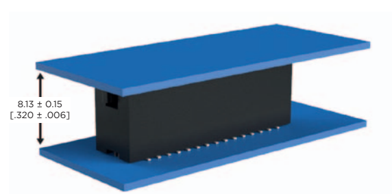
8.13 [.320] Mated Stack Height