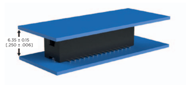
6.35 [.250] Mated Stack Height