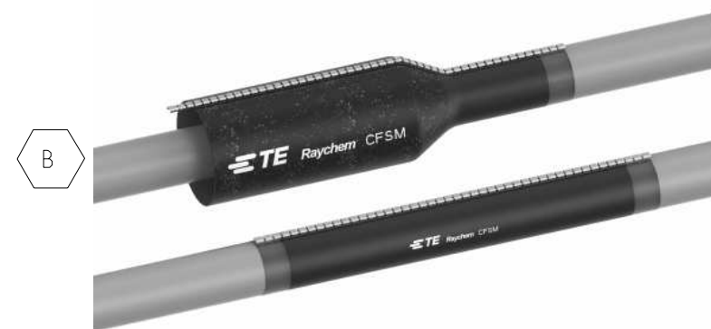
PRODUCT SPEC - 108-160628