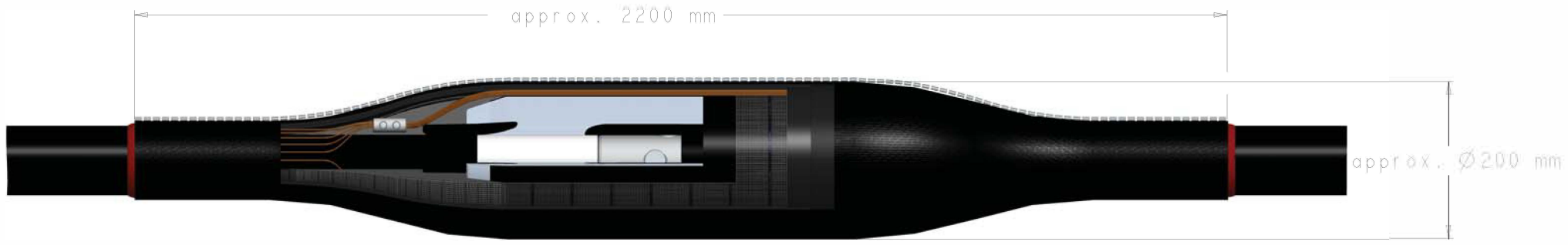
INLINE 145 kV

While TE Connectivity (TE) has made every reasonable effort to ensure the accuracy of the information in this catalog, TE does not guarantee that it is error free, nor does TE make any other representation, warranty or implied warranties regarding the information contained herein, including, but not limited to any implied warranties or merchantability or fitness for a particular purpose. The dimensions in this catalog are for reference purpose only and are subject to change without notice. Specifications are subject to change without notice. Consult TE for the latest dimensions and design specifications.