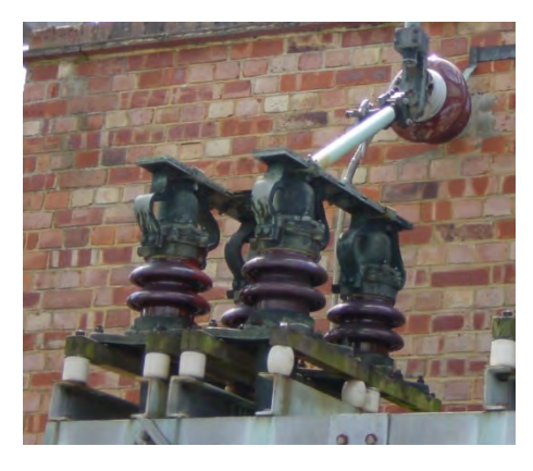
Figure 8. Phase to ground bridging in the U.K. and in Germany