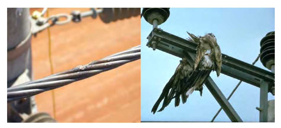
Figure 1. Damage to conductor known as "stranding". Figure 2. Dead bird fallen away from contact area.

of what happened whereas the bird or animal that falls to the ground or on top of a transformer is quite likely to be removed by some predator. (Figure 2 shows a typical occurrence – before being removed)