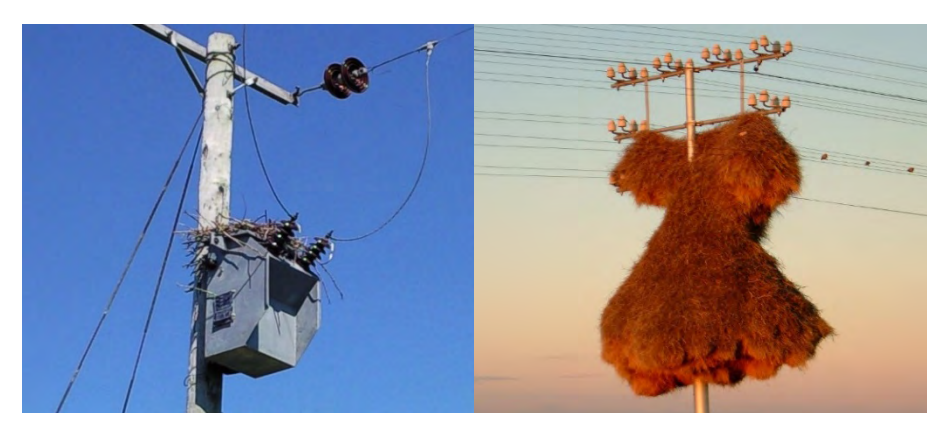
Figure 4. Pole top transformer nest site and huge nest structure in South Africa.

on that same pole or tower. The exact nature of failure depends on the design of equipment, type of bird, voltage etc. but can be simple bridging while perching on an medium voltage cross arm, guano induced failure most often on high voltage suspension towers, nesting materials falling out of nests as the nest structure grows or groups of birds flying in and around jumpers where there is a switch or pole top transformer.