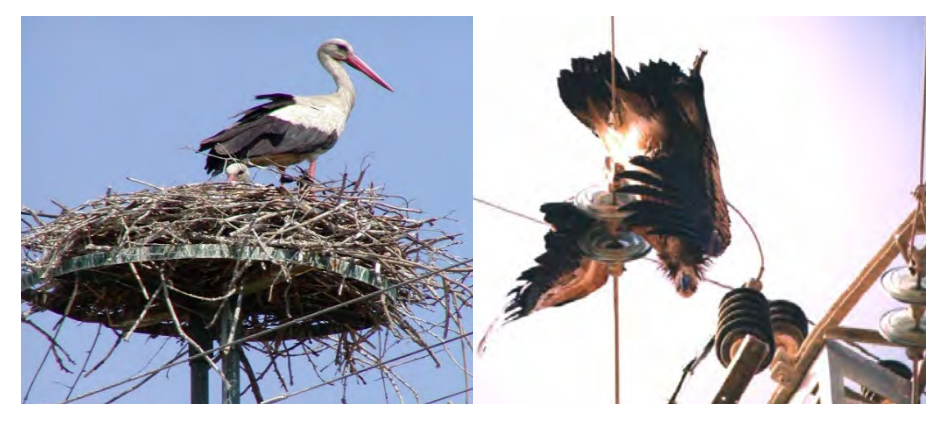
Figure 5. Migratory stork nest in Greece and griffon vulture fatally bridging in Israel.