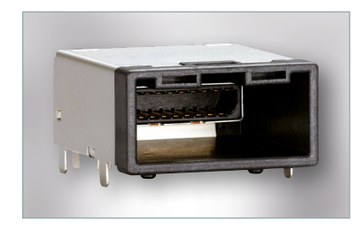
HDMI Type E Header (H)