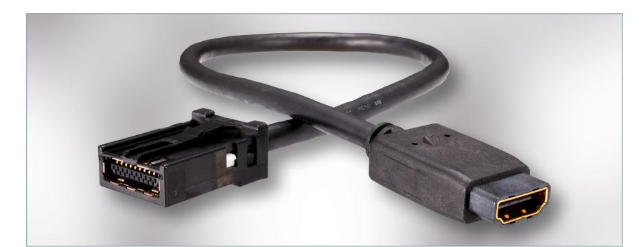
HDMI Type A Type E Harness