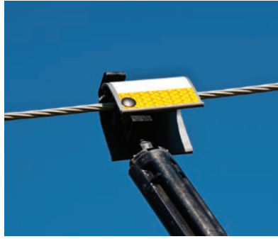
BCIC-AFD-01 Hot-stick twist off