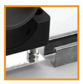
SLIDER PLATE VERSION Used where access to the end of the mounting rail is achievable

Clamps without hardware can be ordered by changing the end of the pole mount parts from "-POLE" to "-CLAMP-ONLY"