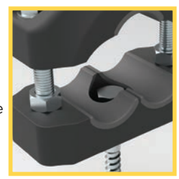
POLE MOUNT VERSION Centre mounting hardware not provided