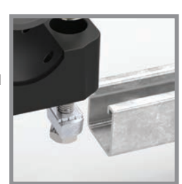
VERSION Used where access to the end of the mounting rail is not possible