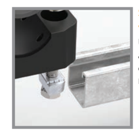
STRUT NUT VERSION Used where access to the end of the mounting rail is not possible