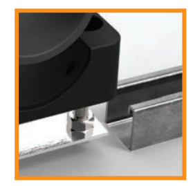
SLIDER PLATE VERSION Used where access to the end of the mounting rail is achievable